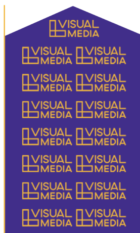
FILE PREVIEW (jpg.png)