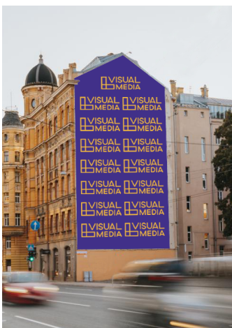
DESIGN VISUALIZATION ON THE BUILDING

TOGETHER WITH PRINT FILE IN TIFF FORMAT, IT IS REQUIRED TO SEND: